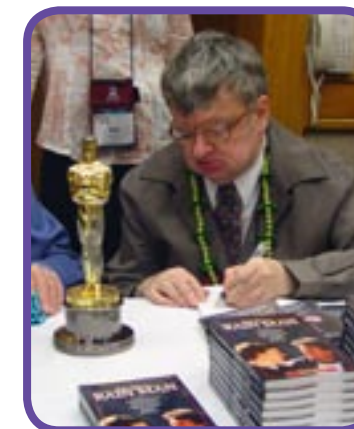
Kim Peek, inspiration for the movie Rainman . Keynote Speaker for Pac Rim 2007.

A premier venue for sharing diverse perspectives, stimulating new thinking and crafting workable solutions—locally, nationally and globally. Over 180 workshops, panels and presentations.